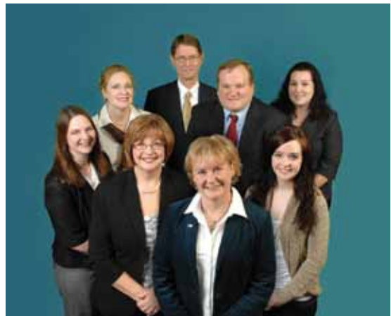
ORGANIZATIONAL DEVELOPMENT/ HR/ACCOUNTING